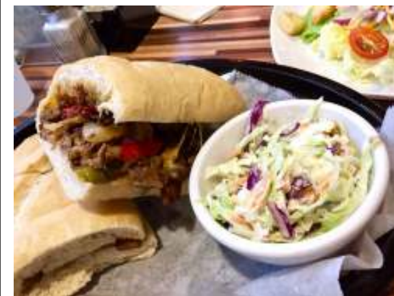
Hungry Bear Cafe

24000 Casa Loma Rd Groveland, CA 95321 (209) 962-0907